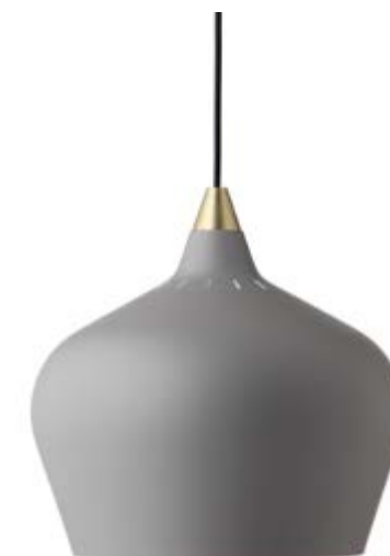
ø16 cm. matt grey: art.no. 100408 ø25 cm. matt grey: art.no. 100423 ø32 cm. matt grey: art.no. 100436 Brass top. Black fabric cord