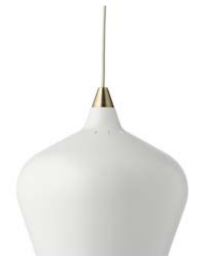
ø16 cm. matt white: art.no. 100413 ø25 cm. matt white: art.no. 100432 ø32 cm. matt white: art.no. 100443 Brass top. White fabric cord