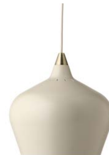
ø16 cm. matt taupe: art.no. 100415 ø25 cm. matt taupe: art.no. 100418 ø32 cm. matt taupe: art.no. 100445 Brass top. Taupe fabric cord