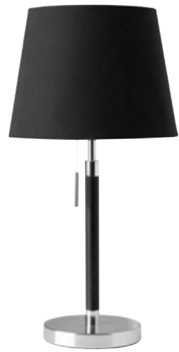
Black / chrome: art.no. 101319