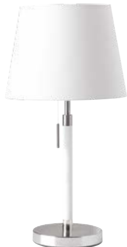
White / chrome: art.no. 101321